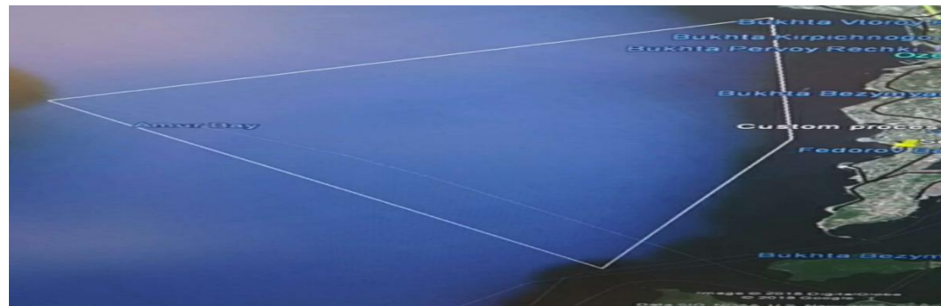
Seven Feet Club, Vladivostok, Russia(N 43° 06.499' ; E131° 52.354' )