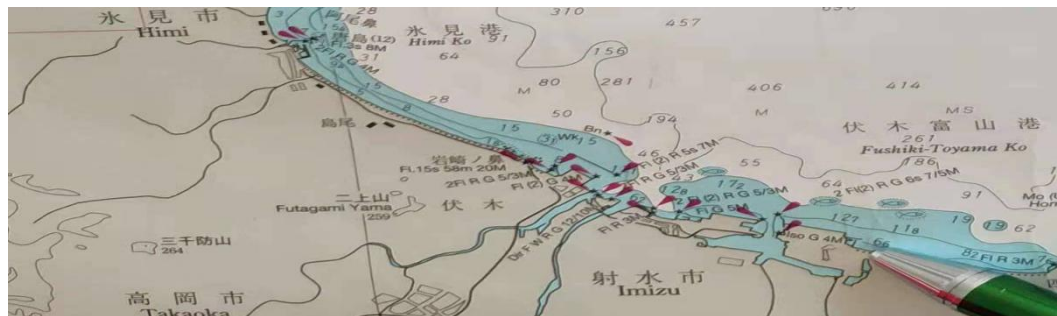
Toyama Marina, Japan (N 36° 46.240' ; E137° 08.283' )